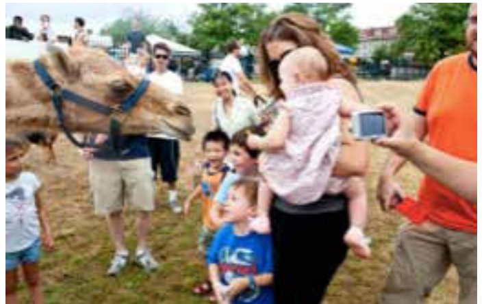
2009 Columbia Heights Day

An all-volunteer board of directors and a volunteer planning committee, responsible for fundraising, organizing, logistics, and managing the annual festival and other events, has governed Columbia Heights Day Initiative.